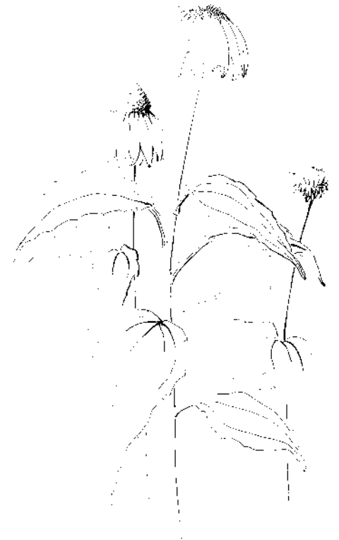
Illustration of Eastern coneflower ( Echinacea purpurea ) by Irena Brubaker, a graduate of the Certificate in Botanical Illustration Program.

NORTH CAROLINA BOTANICAL GARDEN THE UNIVERSITY OF NORTH CAROLINA AT CHAPEL HILL