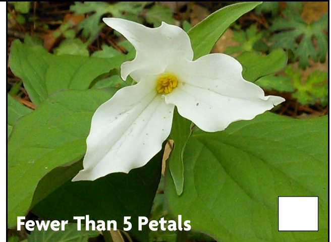
Fewer Than 5 Petals