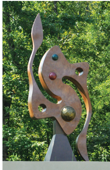
At the entrance: Wayne Vaughn, Miró's Garden

30% of each sale supports the North Carolina Botanical Garden. All pieces remain on site until the end of the show.