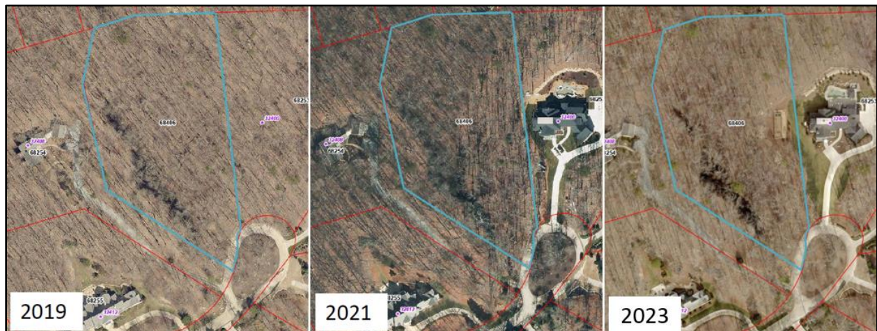
Aerial images of Highland Pond Preserve (in blue outline) showing encroachment over time

In the course of conducting an annual property inspection, a serious encroachment was discovered at Highland Pond Preserve, also known as Edwards Mountain Preserve. This preserve is located within the Governor’s Club community in Chatham County and is the site of breeding pool for salamanders and other amphibians. An adjacent landowner recently built a house and has cleared trees on about .2 acres of NCBGF property and installed a batting cage, retaining wall, and landscaping. The encroachment area has been surveyed and marked and the landowner has removed structures and materials from the area. Negotiations are now underway to have native trees and other vegetation restored to the site by a contractor. This is the first time the Foundation has experienced such a significant encroachment, but under the guidance of the Conservation Committee, Garden staff have done an excellent job addressing this problem in an appropriate and timely manner.